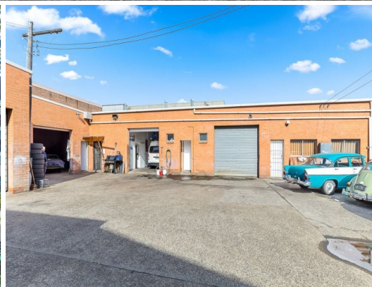
FACTORY 2/ 15-17 West Street, Brookvale