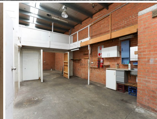
FACTORY 2/ 15-17 West Street, Brookvale