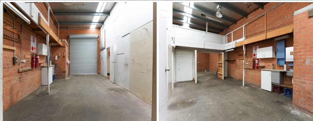
FACTORY 2/ 15-17 West Street, Brookvale