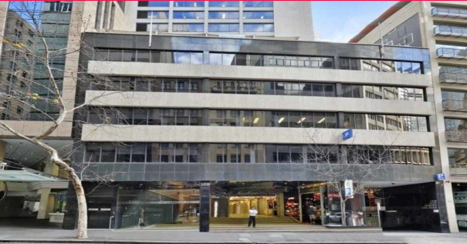
Suite 605, 109 Pitt Street, SYDNEY