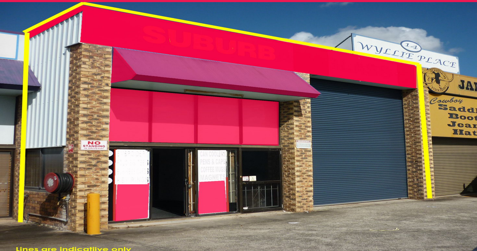
Lines are indicative only