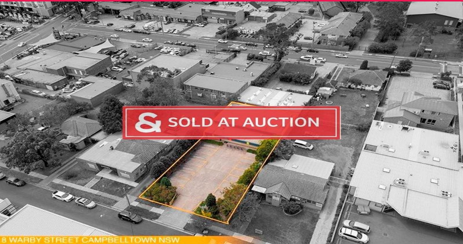
8 WARBY STREET CAMPBELLTOWN NSW