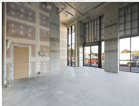
G10/146 BELL STREET, COBURG