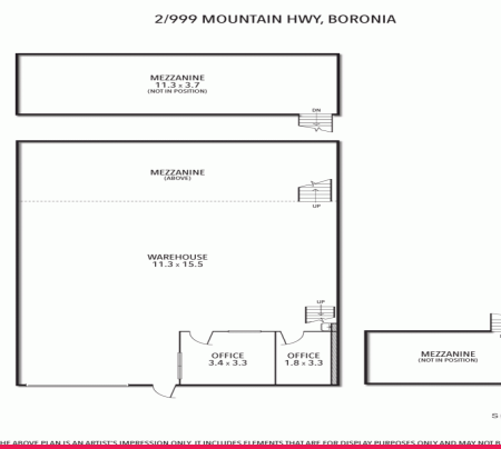
2/999 Mountain Highway, Boronia VIC 3155