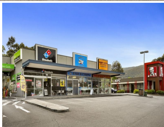
7A/1009 BURWOOD HIGHWAY, FERNTEE GULLY