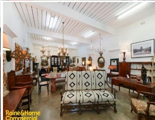
377 Gardeners Road Rosebery NSW 2018