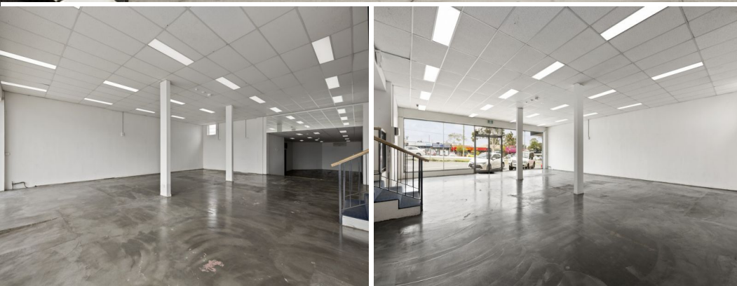
123 CANTERBURY ROAD, HEATHMONT