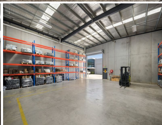
17/56 NORCAL ROAD, NUNAWADING