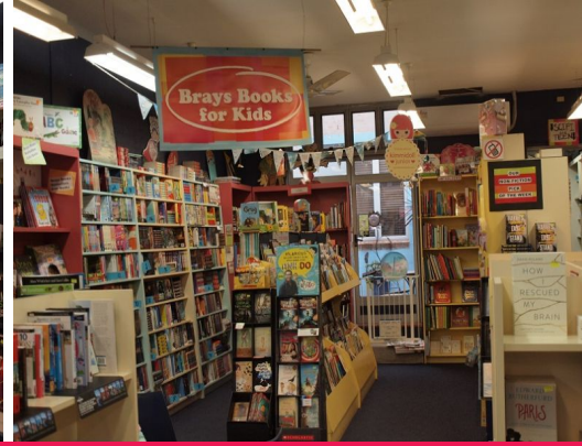
Shop/268 Darling Street, Balmain NSW 2041