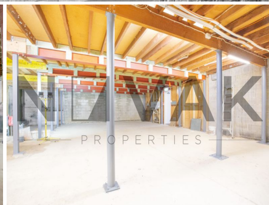
65 Middleton Road, Cromer