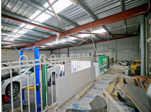
Unit 2, 36 Munt Street, Bayswater WA 6053