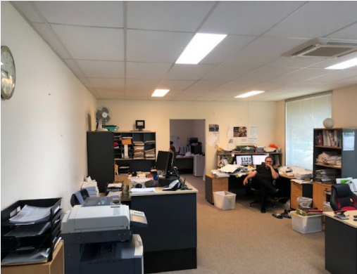
18/7-9 Grant Street, Cleveland QLD 4163