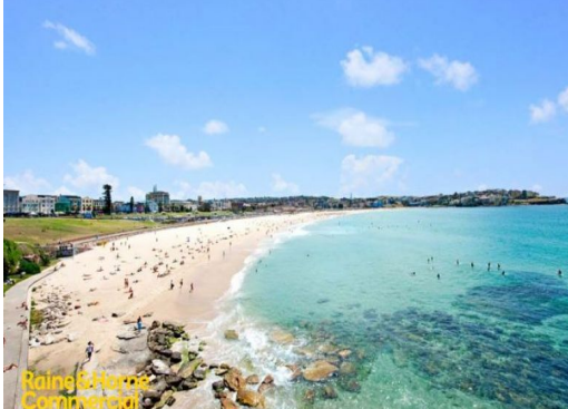
Shop 2, 35 Campbell Parade, North Bondi NSW 2026