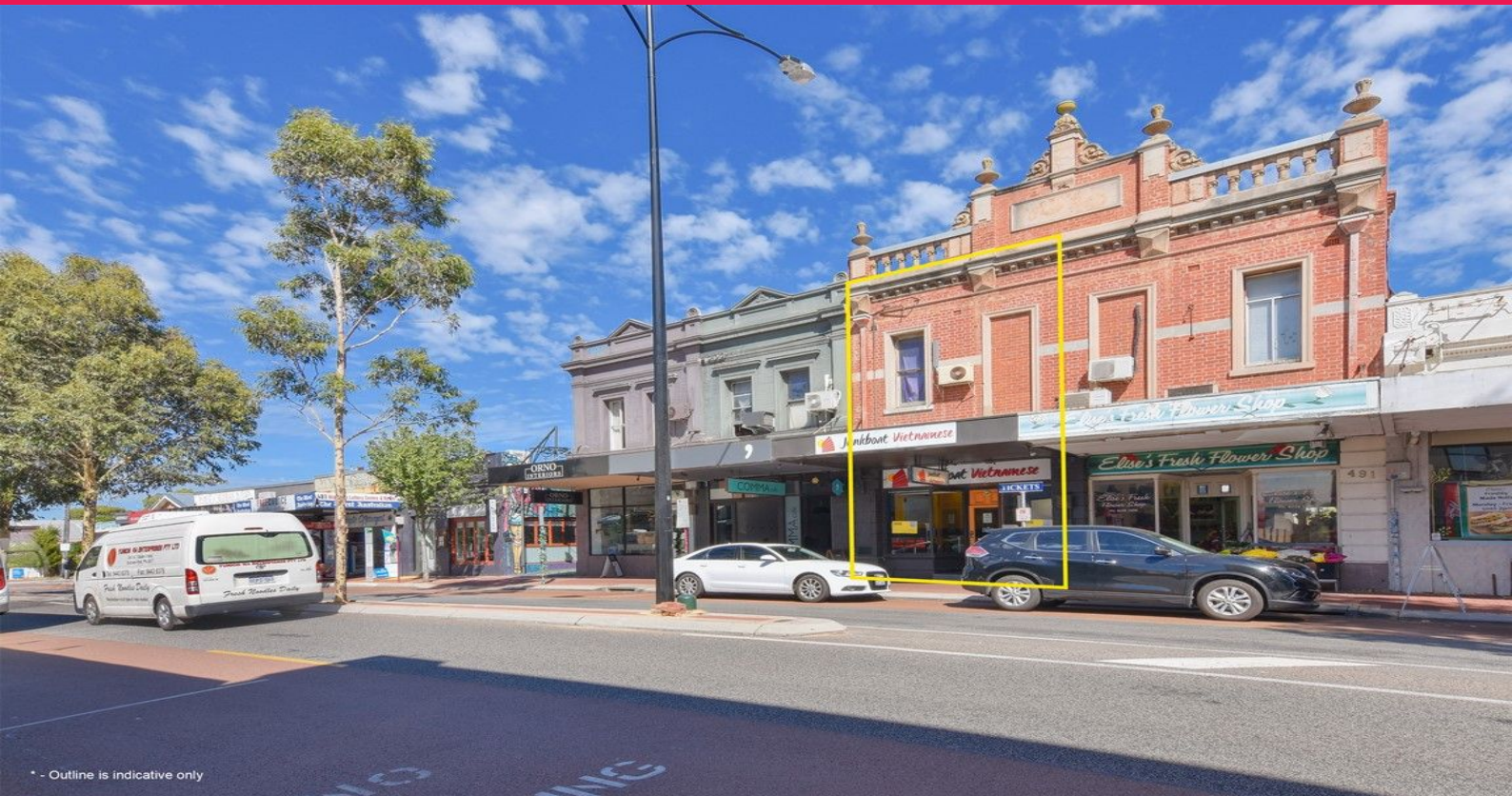
* - Outline is indicative only