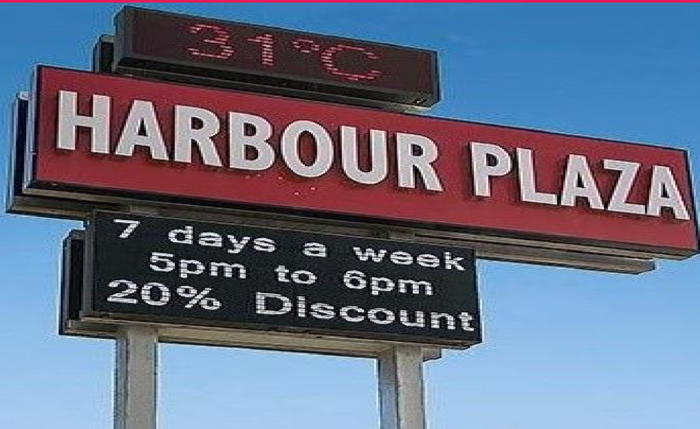
Shop 4A – Approx 126m 2