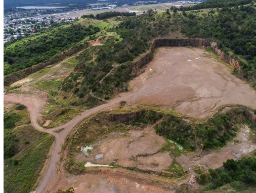
1a Raymond Street, Speers Point NSW 2284