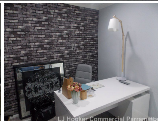
LJ Hooker Commercial Parramatta

Suite A/76 Station Street, Wentworthville NSW 2145