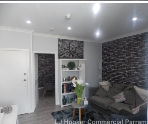
LJ Hooker Commercial Parramatta