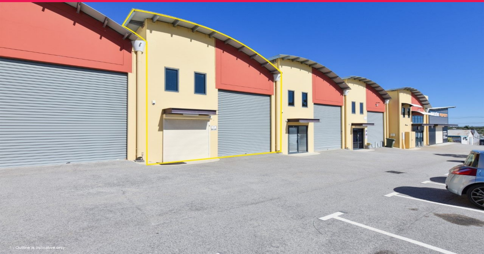
Outline is indicative only