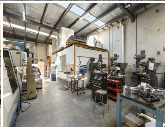
2/22 SALICKI AVENUE, EPPING