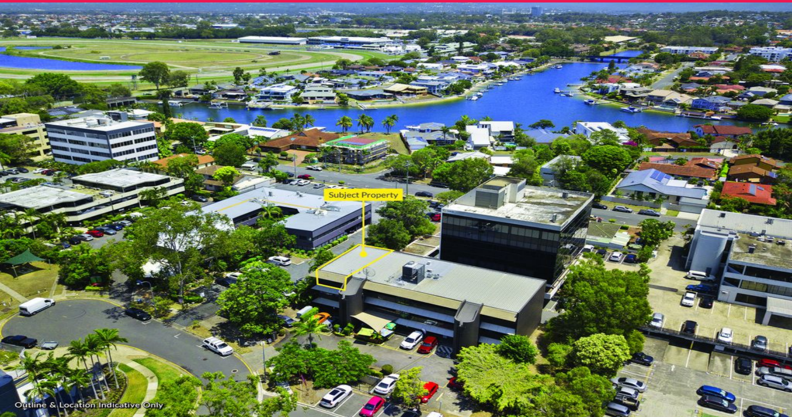
Outline & Location Indicative Only