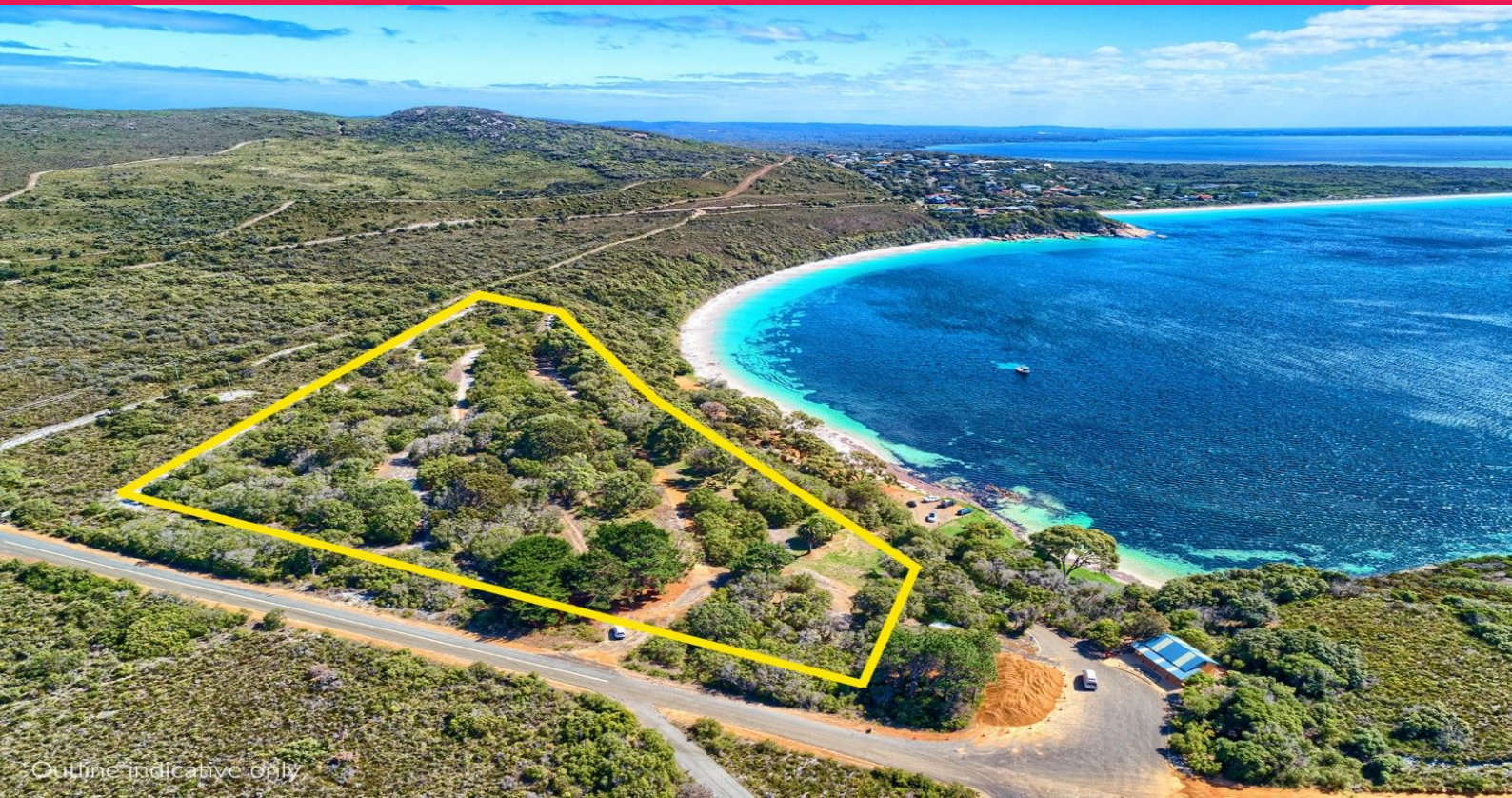
Outline indicative only