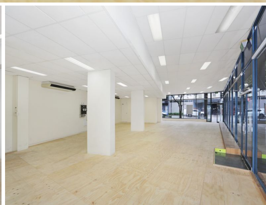
Shop 106 and 107/ 92-120 Cleveland Street, CHIPPENDALE