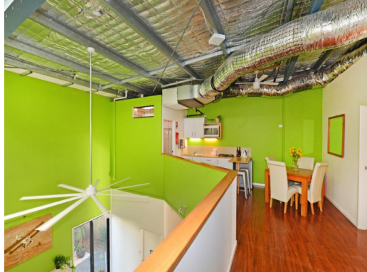
Unit 5/21 Production Avenue, Noosaville QLD 4566