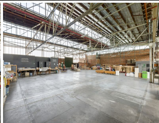
3/8-12 SIMLA STREET, MITCHAM