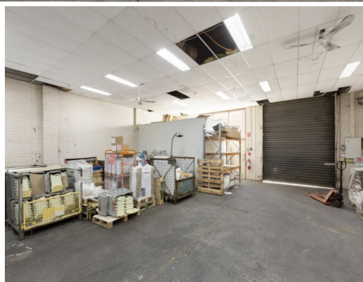
UNIT 2/7 ELLIOT PLACE, RINGWOOD