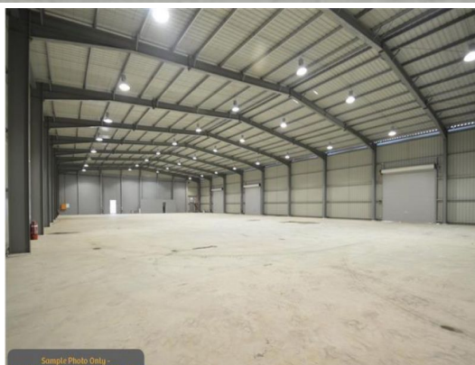
Sample Photo Only - Facility to be built under construction