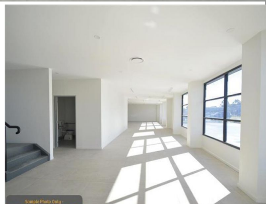
Sample Photo Only - Facility to be built under construction