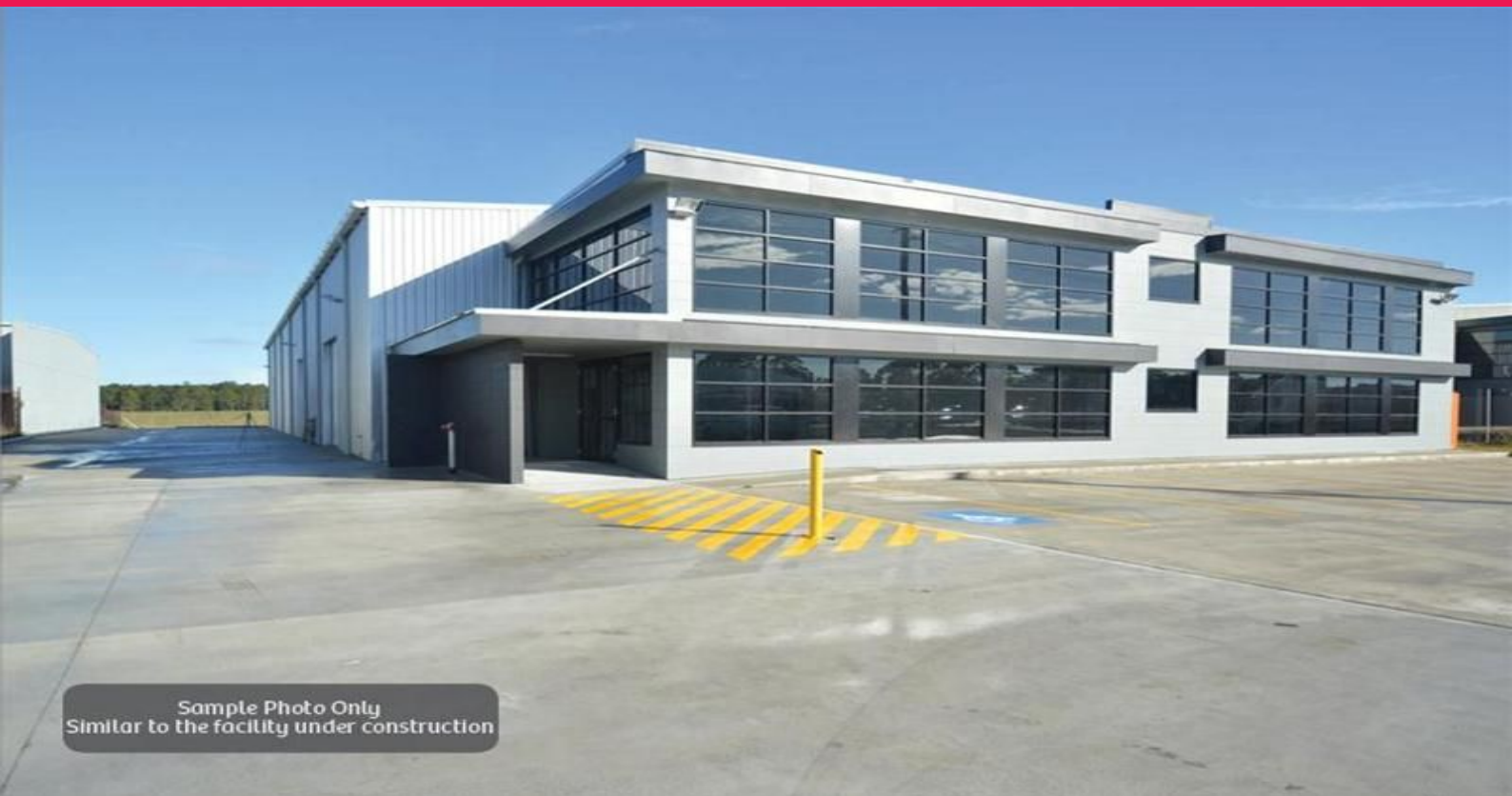
Sample Photo Only Similar to the facility under construction