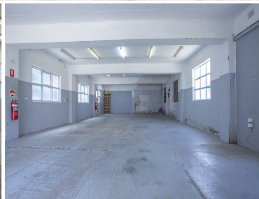
FACTORY 5 / 15-17 West Street, Brookvale