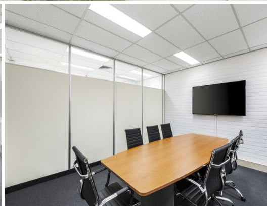
5/1016 DONCASTER ROAD, DONCASTER EAST