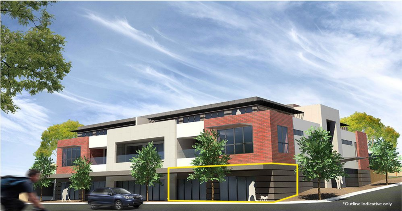
*Outline indicative only