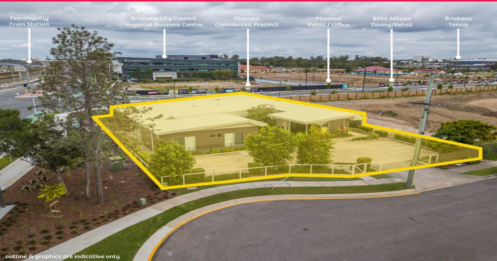
outline & graphics are indicative only