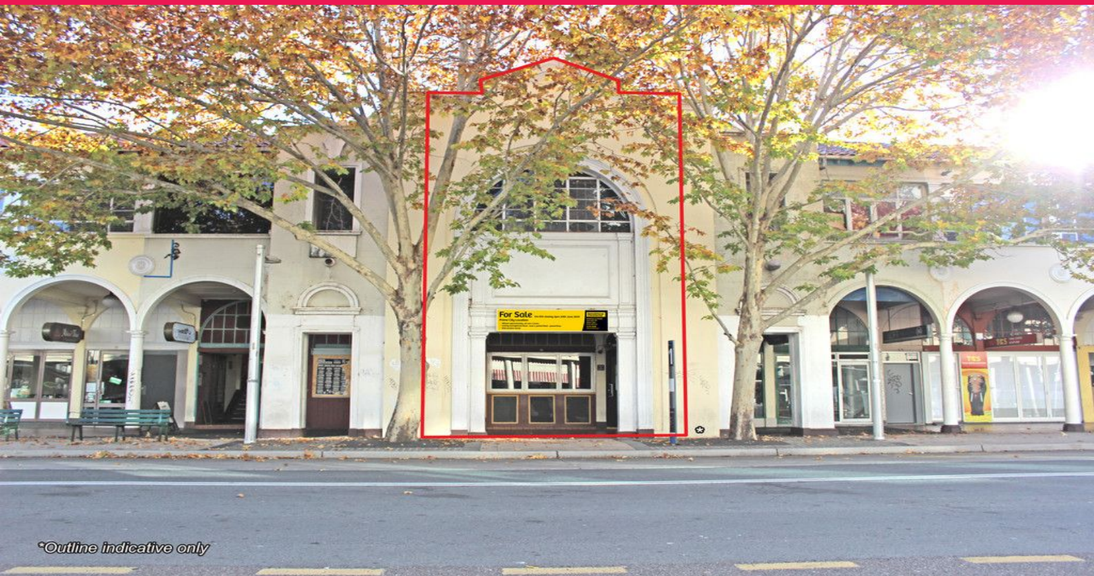
*Outline indicative only