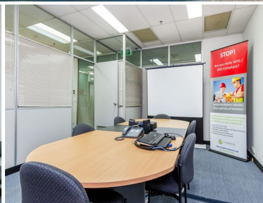
41E/190-200 Jells Road, Wheelers Hill