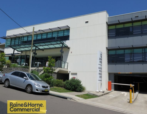
Suite 8 12 Jarrett Street, North Gosford NSW 2250