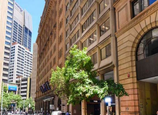
Suite 703/23 O'connell Street, Sydney NSW 2000