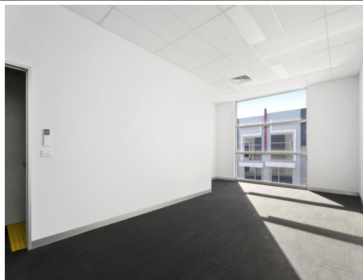
11/8-10 MONOMEETH DRIVE, MITCHAM