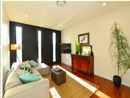
Unit 5/21 Production Avenue, Noosaville QLD 4566