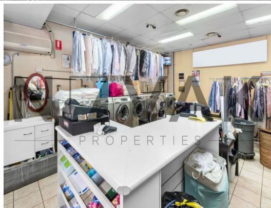
1 Collaroy Street, Collaroy