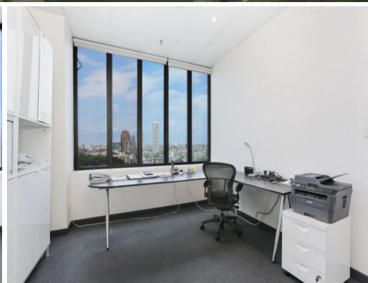
Suite 38, Level 12, 60 Park Street, SYDNEY