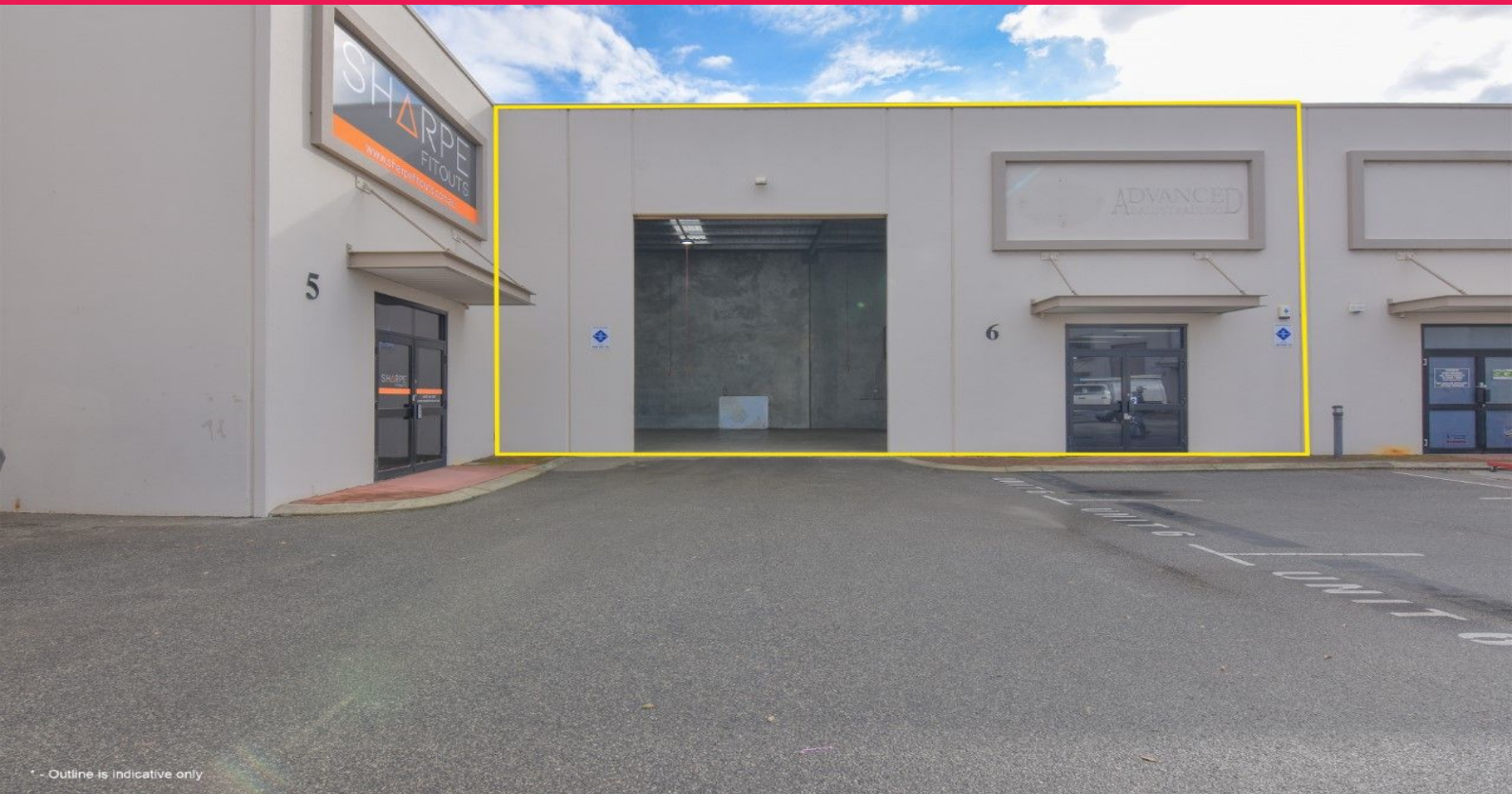
* - Outline is indicative only