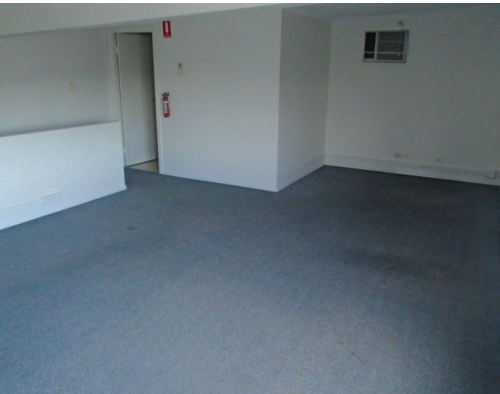
7,I3/70 Flanders Street, Salisbury QLD 4107