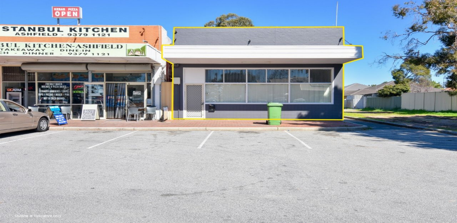
Outline is indicative only