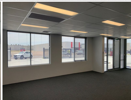
26 Barley Place, Canning Vale