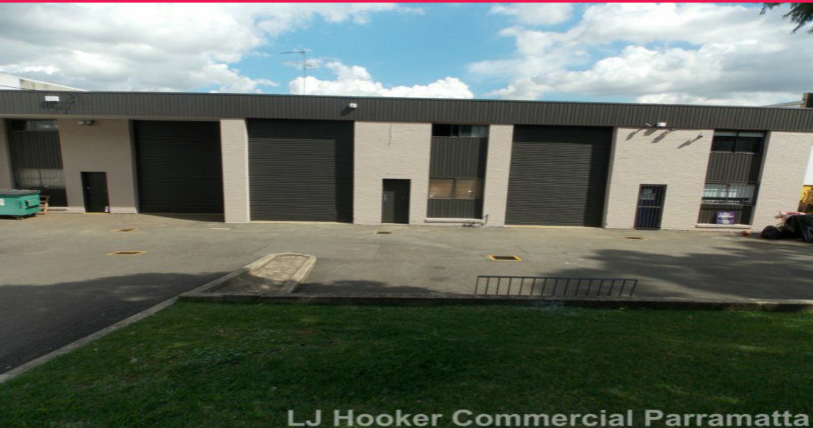
LJ Hooker Commercial Parramatta