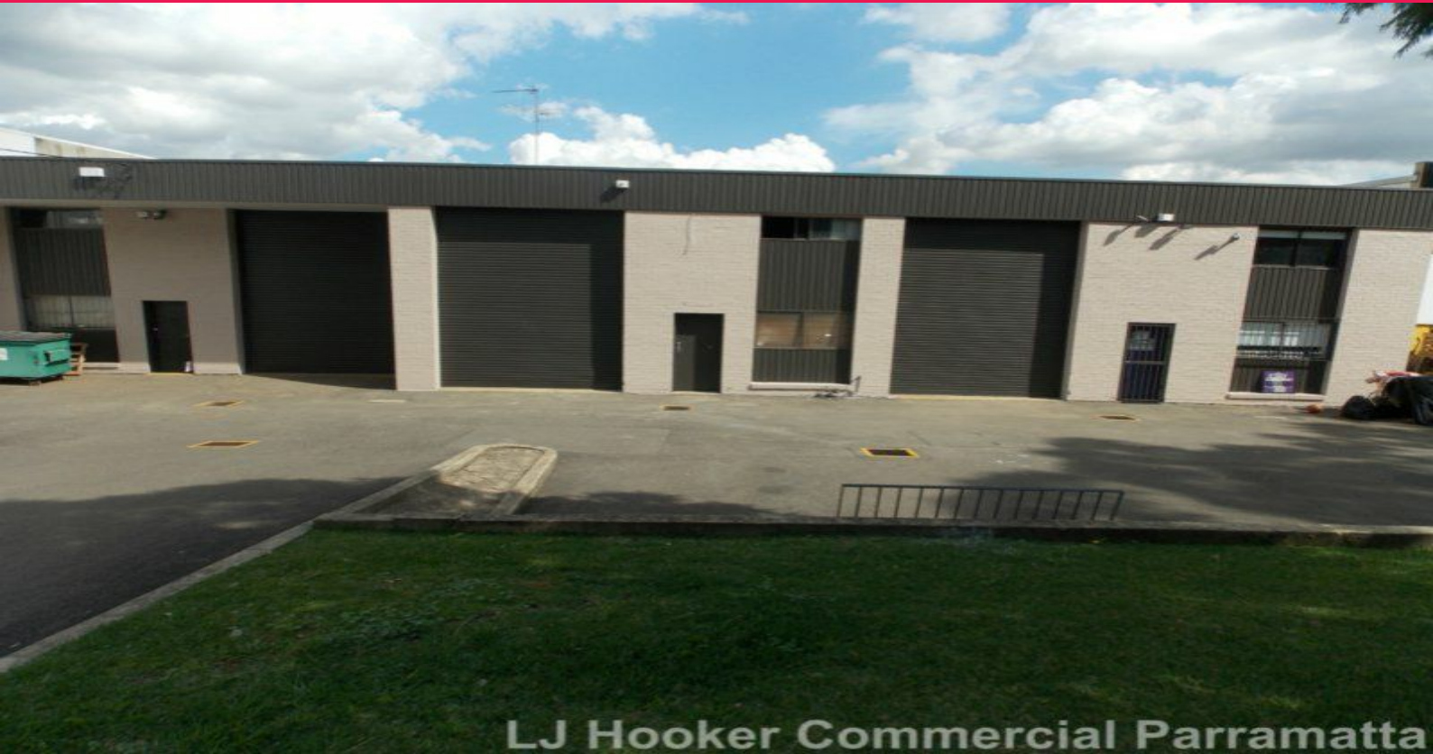
LJ Hooker Commercial Parramatta