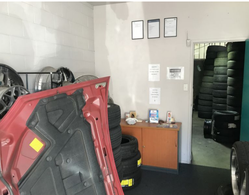
2/14 Lapis Street, Underwood QLD 4119