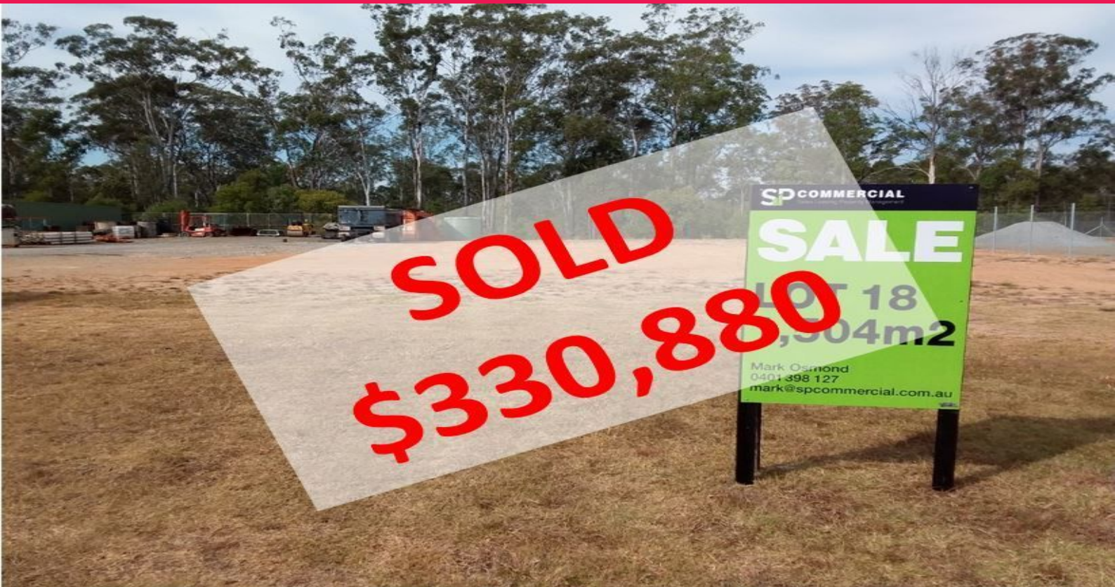
DISCLOSURE PLAN FOR PROPOSED LOT 18