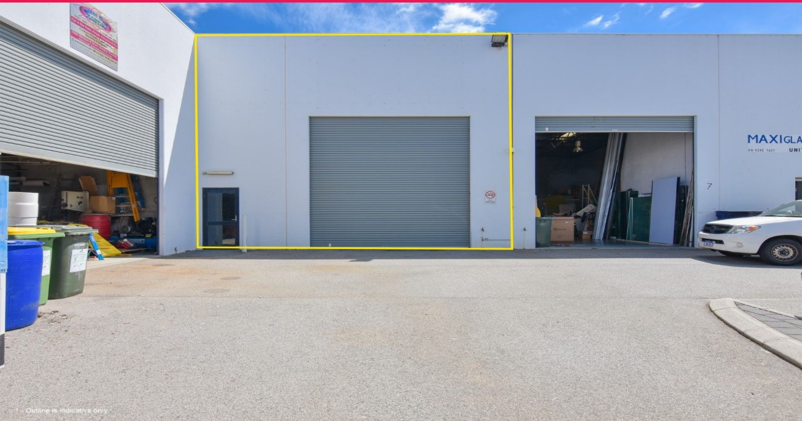
Outline is indicative only