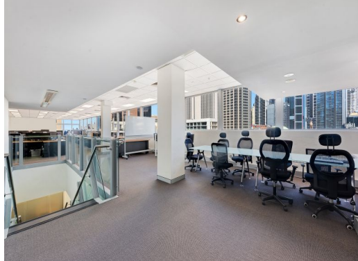
Suite 1102/46 Market Street, Sydney NSW 2000